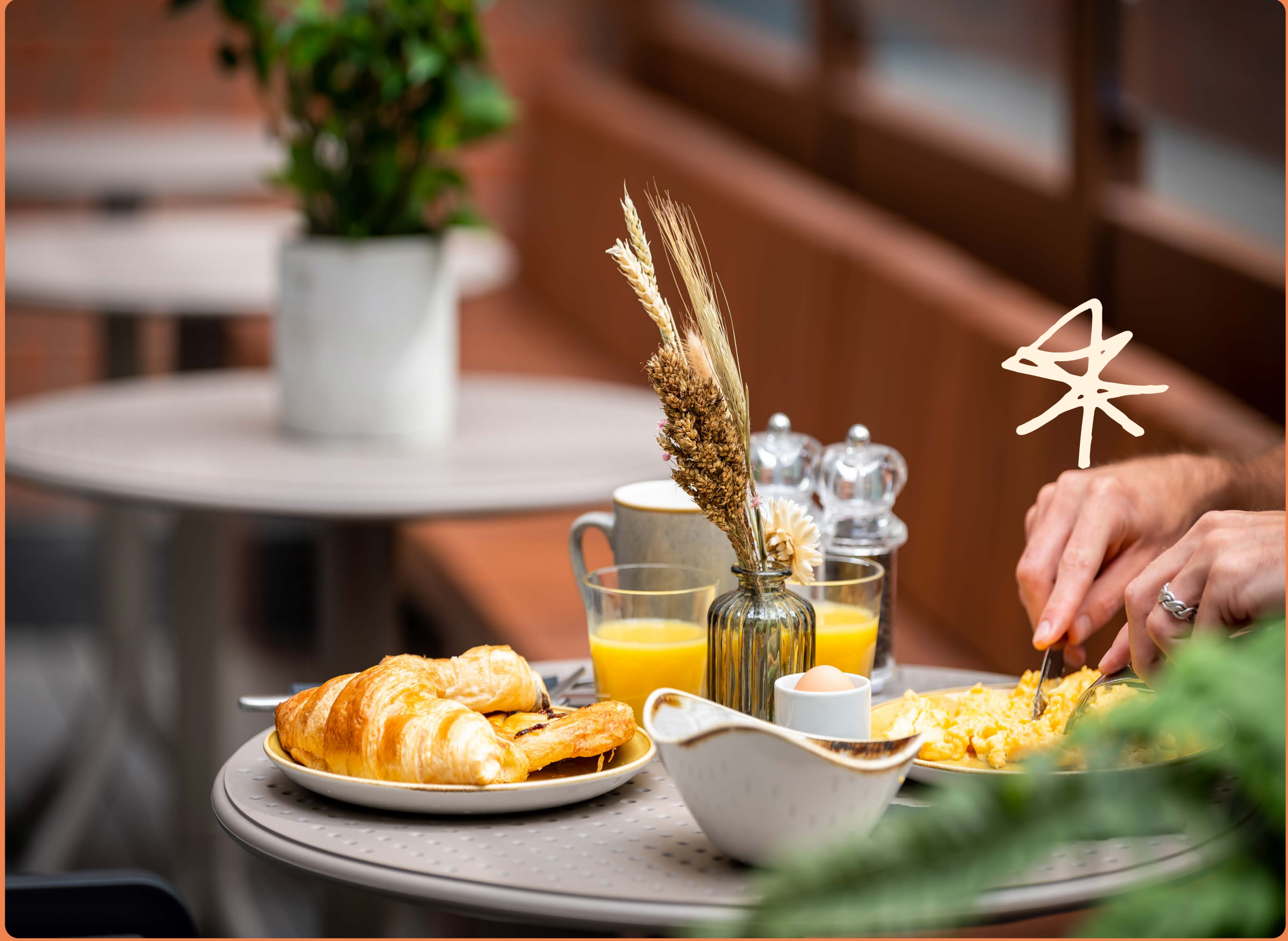
* most important meal of the day