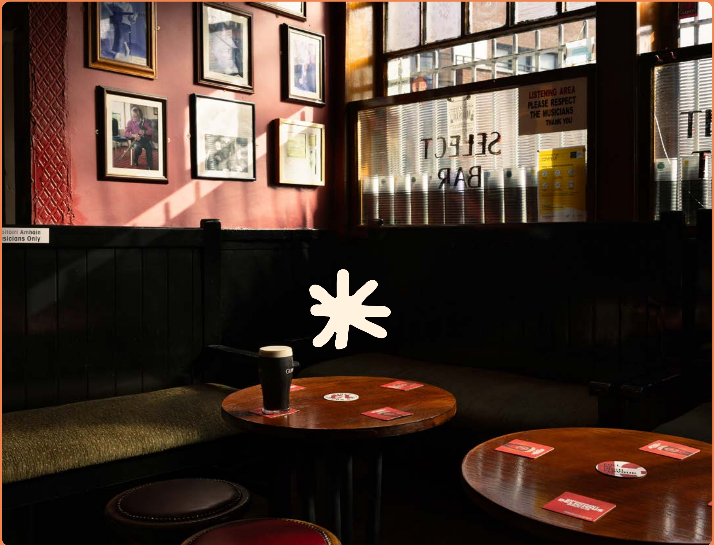
* hair of the dog